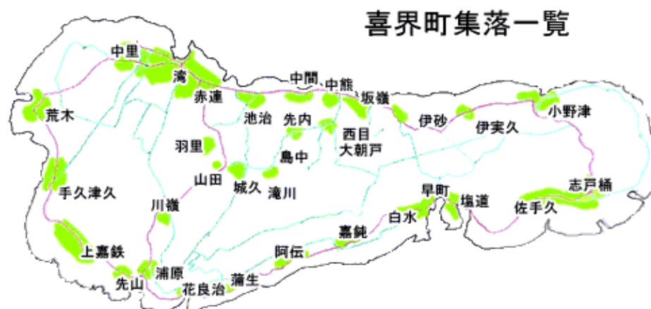
Figure 2. Map of villages within Kikai Town (reproduced from the official website of Kikai Town).